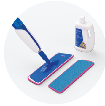
Cleaning kit QSSPRAYKIT

This cleaning product was specifically developed for Quick-Step floors. It cleans the surface thoroughly and safeguards its original appearance, maximising that 'new floor' experience.