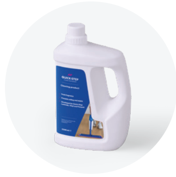
Cleaning product 1 L or 2.5 L QSCLEANING1000 QSCLEANING2500

This cleaning product was specifically developed for Quick-Step floors. It cleans the surface thoroughly and safeguards its original appearance, maximising that 'new floor' experience.